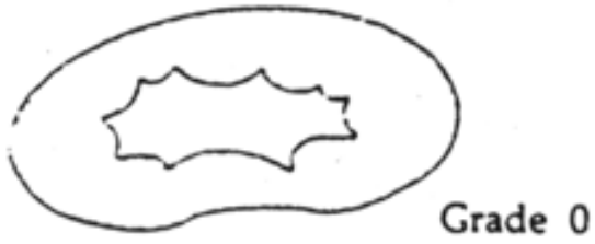
Figure 2 (SFU Grading of Hydronephrosis)