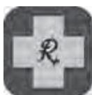
The Pharmacy Guild of Australia