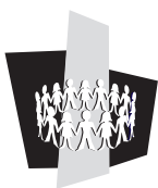
Australian Early Childhood Association Inc