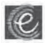
Federation of Ethnic Communities' Councils of Australia